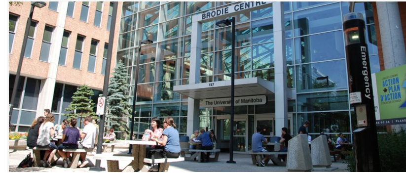
Bannatyne 229 Brodie Centre Neil John Maclean Health Sciences Library